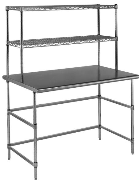
AdjustTable® with Wire Overhead System —shown with two C-frame bases

Eagle AdjustTable® Work Surface System with Wire Overshelf System, model _____. Heavy gauge brushed stainless steel top with choice of base combination: one wire undershelf and one C-frame or H-frame, or two C-frames or H-frames. Two 14"-wide (chrome, stainless steel) wire overshelves. Two 33" front posts, two 63" rear posts, and two 29" front posts for wire overshelves. Wire undershelves and overshelves feature patented QuadTruss® design (patent #5,390,803).