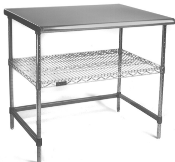
...with C-frame base and wire shelf