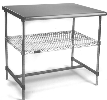
adjuSTable® with H-frame base and wire shelf...

Eagle AdjuSTable® Work Surface System, model _____. Heavy gauge brushed stainless steel top with choice of base combination: one wire undershelf and one C-frame or H-frame, or two C-frames or H-frames. Four 33" front posts. Wire undershelves feature patented QuadTruss® design (patent #5,390,803).