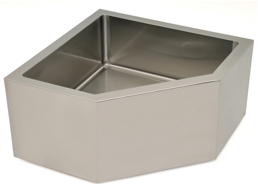
corner mop sink #F2121-8-CNR

Five-sided corner construction allows easy access for use. 18"-wide front. 1½"-wide top edge. Included drain is no-caulk style, which easily attaches to plumbing stub up. Available in overall size of 24" x 24" with 21" x 21" sink bowl, or overall size of 27" x 27" with 24" x 24" sink bowl.