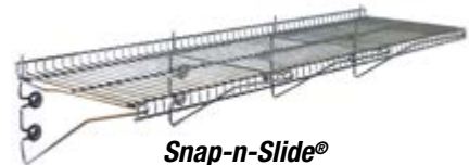
Snap-n-Slide® –Wire Wall Shelves