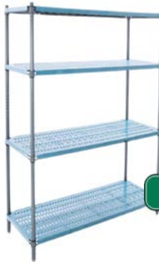
QuadPLUS® Polymer Units – 4 or 5 Shelf Units

Click on the EG number button to download the spec sheet for each product.