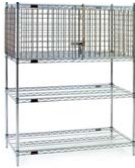
Module Unit* – Hinged Door