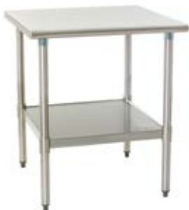
Stainless Steel Worktables - with Undershelf