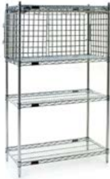
Module Unit* – Flip-Up Door