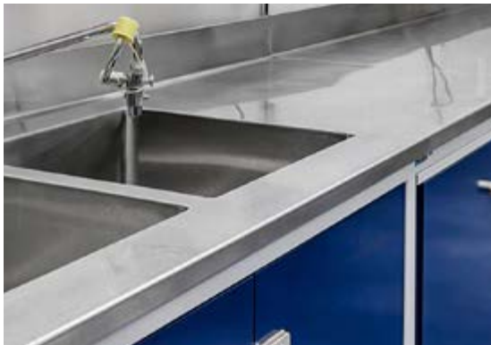
Stainless Steel Countertops