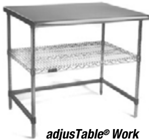
adjusTable® Work Surface System