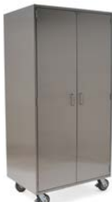
Vertical Storage Cabinet - Mobile