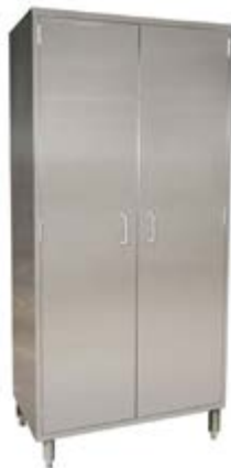
Vertical Storage Cabinet - Stationary