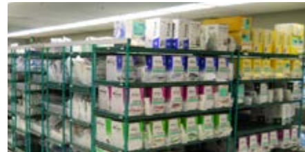
QuadPLUS® Polymer Shelving - Green Panels