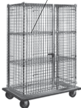
Mobile Security Unit – Chrome Finish