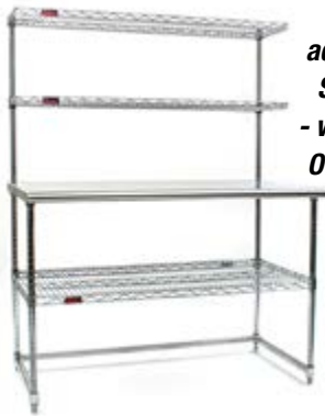
adjusTable® Work Surface System - with Cantilevered Overhead System