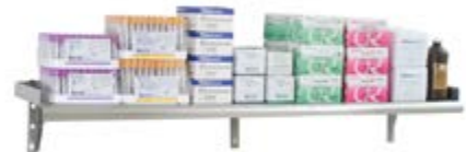
Snap-n-Slide® –Solid Shelves