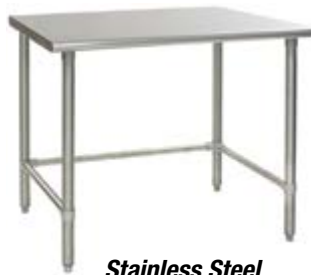
Stainless Steel Worktables - with Tubular Base