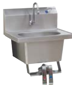
Traditional Hand Sink -with Knee Valve