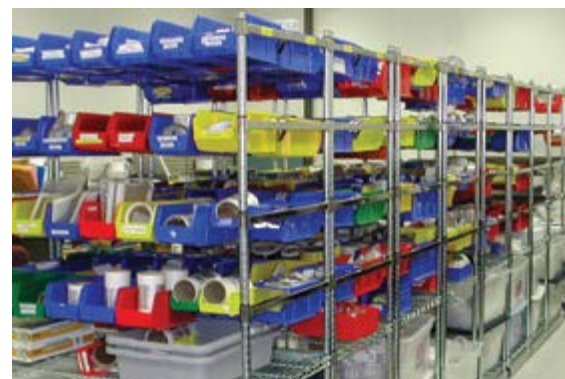
Double Deep Floor-Trak® shown with bin rails, sold separately.