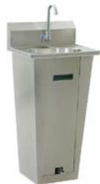
Traditional Hand Sink -with Foot Pedal