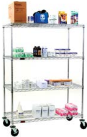
QuadTruss® Units – 4 or 5 Shelf Units