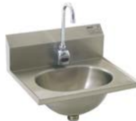
Traditional Hand Sink -with Battery Powered Faucet