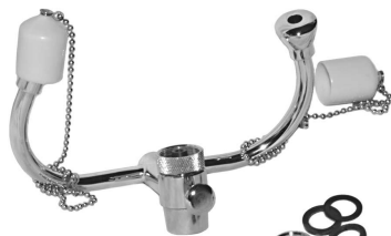
emergency eye wash unit #326272