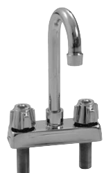
deck mounted faucet