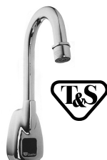
T&S electronic-eye faucet