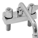
deck mounted faucet with 8" spout