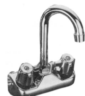
splash mounted faucet