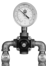
anti-scald valve #373848