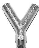
non-temperature adjustment valve