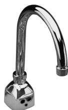
battery-powered electronic-eye faucet