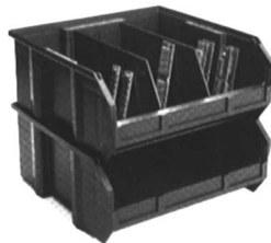
bins with dividers