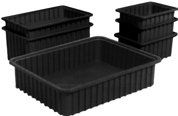
assorted divider tote boxes