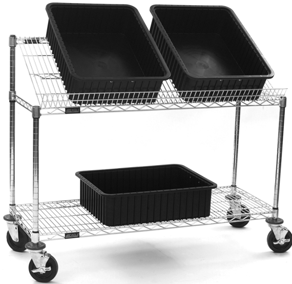
48" (1219mm)-long benchside tote box carrier shown with tote boxes

Angled wire shelf with 3½" upturn, zinc-plated. Overall height of 39", with front working height of 30". Length dimension of 24", 36", 48", or 60". 18" width. 5" resilient casters, two with brake. Standard wire undershelf.