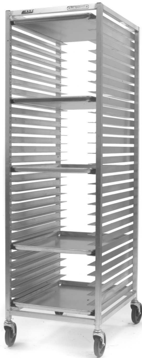
all-welded unit #OUR-1830-2/W

Constructed of 1" square tubular aluminum frame and supports. 1 1/2" x 1 1/2" extruded aluminum tray slides with two raised beads to minimize friction. Slides are welded to vertical posts. Slide spacing to be 2" to accommodate 30 full size sheet pans. Furnished with 5"-diameter casters. Front-loading and side-loading models available. Shipped assembled. 69 1/4" height and features open top.