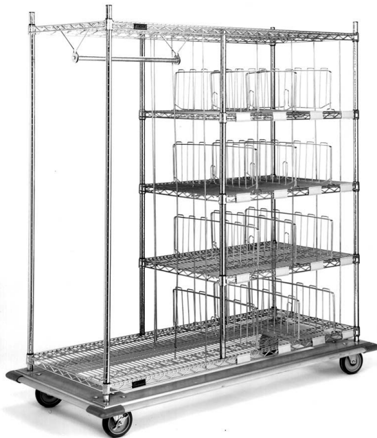
#PCH2460C heavy duty cart

Available in 24" x 48" and 24" x 60", chrome plated finish. Eight dividers and 12 bin markers standard with 48" units, and 12 dividers and 16 bin markers on 60" units. Standard units feature 5" x 1 1/4" swivel stem casters, two with brake. Heavy duty units feature aluminum dolly base with 6" x 2" swivel plate casters with polyurethane wheels, two with brake. All models include a 24" coat hanger tube and 12 rod and tabs.