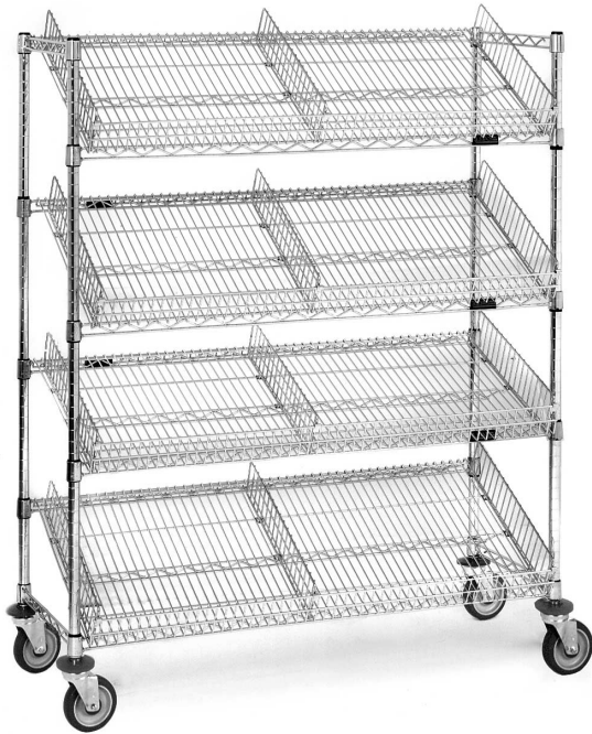
four-shelf suture cart

Four or five variable angle shelves 18" wide x 36" or 48" long x 69" tall. 63" post with 5" polyurethane casters, two with brakes. Three dividers per shelf. All components are chrome plated.