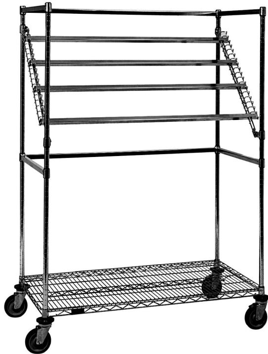
#SWC2460C sterile wrap cart

Chrome-plated 24" wide by 48" or 60" lengths. Four support bars with a wire shelf at the base and a three-sided channel frame at the mid height and top. 5" diameter polyurethane swivel casters.