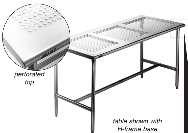
table shown with H-frame base

Perforated 14 gauge type 304 worksurface with #4 brushed stainless steel finish. Perforations are \frac{3}{4} "-diameter on 1" centers. Available with 1\frac{5}{8} " C-frame or H-frame tubular base, or with undershelf base. Uni-lok® gusset system. Stainless bullet feet adjustable to 1".