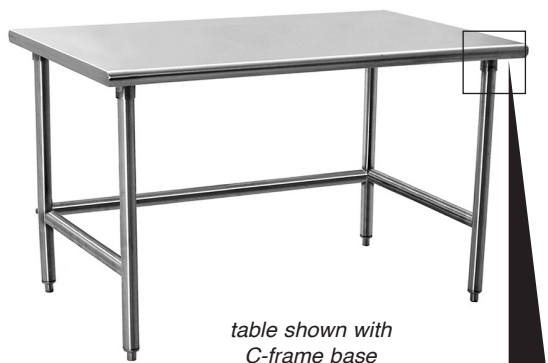
table shown with C-frame base

Solid 14 gauge type 304 worksurface with #4 brushed stainless steel finish. Available with 1½" C-frame or H-frame tubular base, or with undershelf base. Uni-lok® gusset system. Stainless bullet feet adjustable to 1".