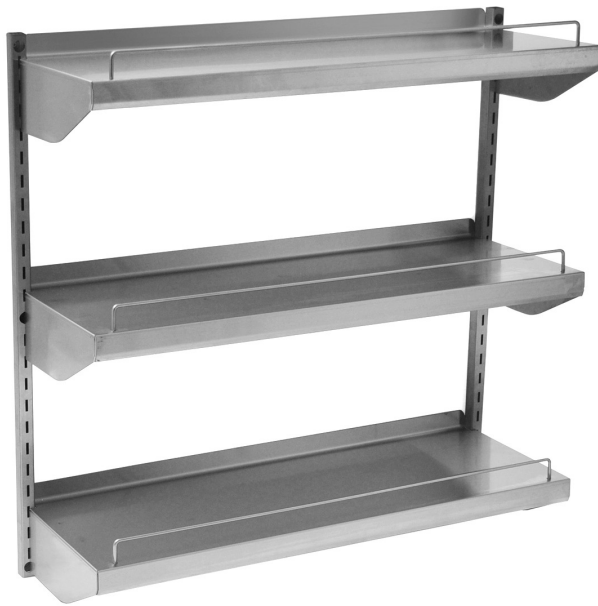
#LSD1236-36-3L laboratory wall shelf unit

Eagle Laboratory Wall Shelves, model _____. Three shelf modular system with stainless steel 16 gauge 1" tubular uprights with laser cut notches for shelf attachment and mounting. 16 gauge type 304 stainless shelves with 1/4" rear upturn, 4 1/2" downturned bookends, and center hat channel. Shelves attached with triple hooks per end adjustable on 1 1/2" centerlines. Uprights are 36 1/2" tall. Shelves are available in 12", 15", and 18" depths and 24", 30", 36", 48", 60", and 72" lengths. Optional wire ledge is available. Designed to meet the SEFA recommended practices.