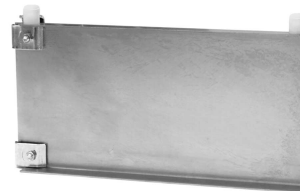
single foot bracket