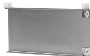
double foot bracket