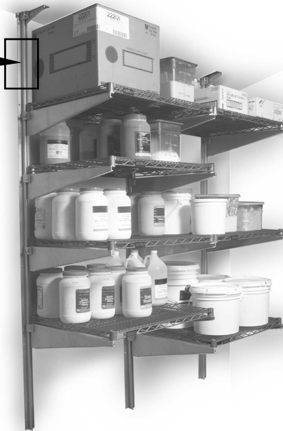
wall-mounted cantilevered shelving shown with wire shelving