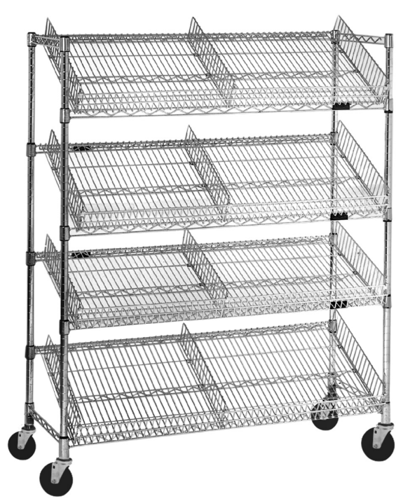
angled shelf/visual merchandising cart shown with optional dividers

Eagle Angle Shelf/Visual Merchandising Cart, model ________. (EAGLEbrite® Zinc, Chrome, Black Epoxy, Valu-Master® Gray Epoxy, Valu-Gard® Green Epoxy) reverse mat angled wire shelves with hangar rails. 3-sided truss assembly at top and bottom for increased strength. (EAGLEbrite® Zinc, Chrome plated) posts with 5"-diameter resilient wheel casters.