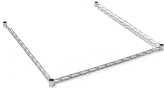
3-sided double truss frame