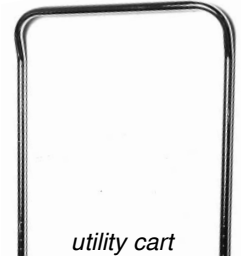
utility cart handle