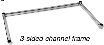
3-sided channel frame