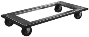
aluminum truck dolly

Includes designated casters and wraparound bumpers. Poly tread.