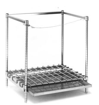
style "A" tank rack with optional drip pan shown

Eagle Tank Rack Style "B", model _____. Unit includes one chrome-plated dunnage mat with frame, four 74" chrome-plated posts, two chrome-plated wire shelves with patented QuadTruss® design, one chrome-plated 3-sided frame, and cable assembly. Shipped knocked down.