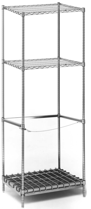
style "B" tank rack with optional drip pan shown