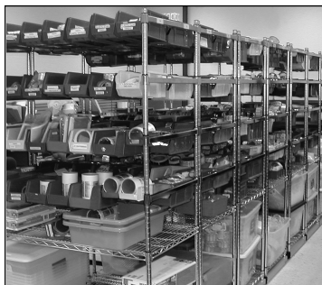
Bin holder rails can also be used on Eagle's Floor-Trak® units*

(bins sold separately - see manufacturer's guide for recommended weight capacity)