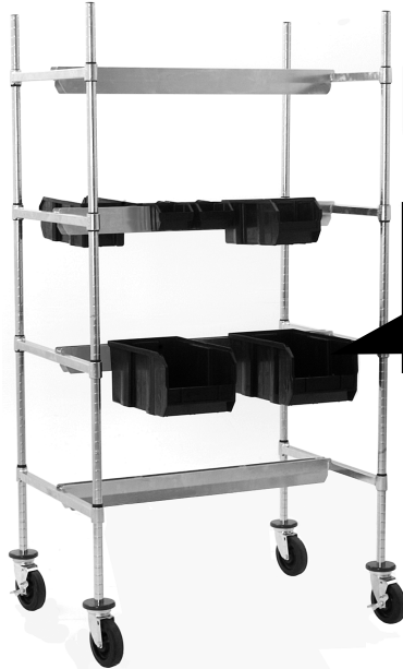
shown assembled as a cart

Eagle Double-Sided Bin Holder Rail Cart, model _____, Four bin holder rails with 63" posts, and resilient casters. Unit shipped knocked down.