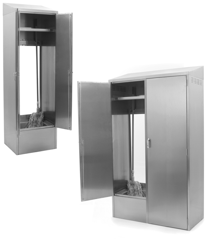
(mop shown not included)