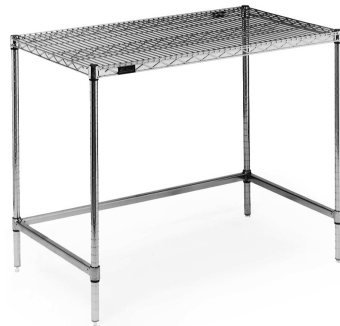
basic wire top workstation

* See charts on back for complete model numbers.