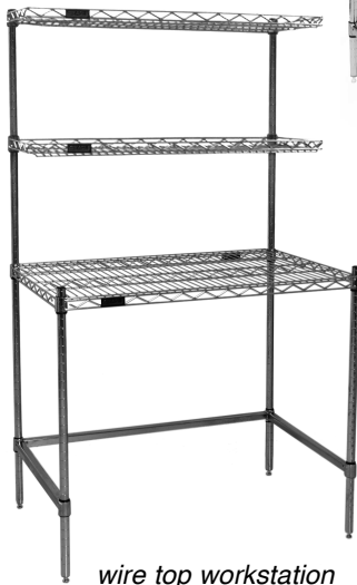
wire top workstation with two overshelves