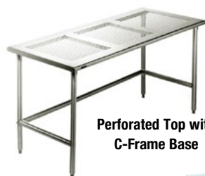
Perforated Top with C-Frame Base