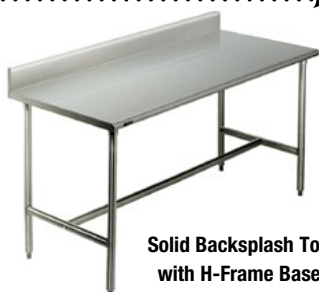
Solid Backsplash Top with H-Frame Base