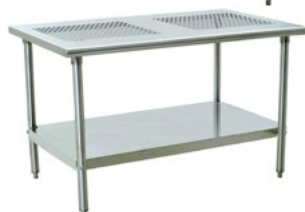
Perforated Top with Solid Undershef