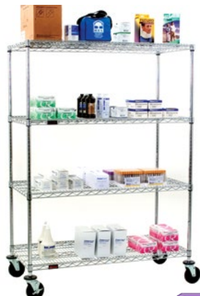
QuadTruss® Units – 4 or 5 Shelf Units