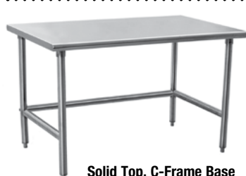
Solid Top, C-Frame Base