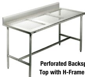
Perforated Backsplash Top with H-Frame Base