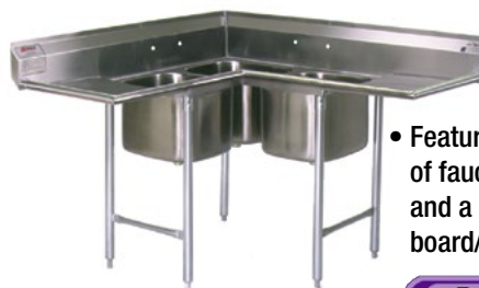
Corner Sinks – 3 Compartment