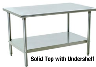
Solid Top with Undershef