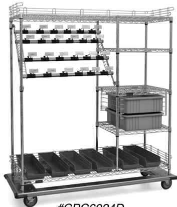
#CPC6024D combination-style cart