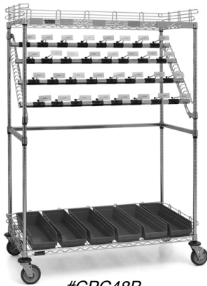
#CPC48B bulk storage cart

Flexible design allows the combination of hanger bars and wire shelves. 24" x 60" x 69" utilize 24" or 36" side wire shelves with hanger bars. Six 4" ledges on top and bottom shelf, two tote slides and boxes optional, 5" polyurethane swivel casters, two with brake. Dolly base available with 5" poly casters, two with brakes.