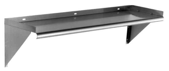
wall shelf with tab lock