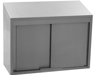
cabinet with sliding doors