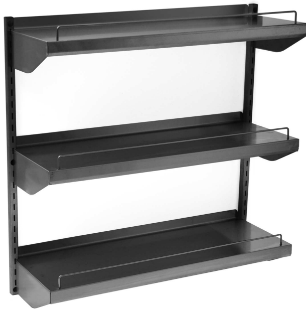
#LSD1236-36-3L shelves with front wire ledge

Eagle Laboratory Wall Shelves, model _____. Three shelf modular system with stainless steel 16 gauge 1" tubular uprights with laser cut notches for shelf attachment and mounting. 16 gauge type 304 stainless shelves with 1/4" rear upturn, 4 1/2" downturned bookends, and center hat channel. Shelves attached with triple hooks per end adjustable on 1/2" centerlines. Uprights are 36 1/2" tall. Shelves are available in 12", 15", and 18" depths and 24", 30", 36", 48", 60", and 72" lengths. Optional wire ledge is available. Designed to meet the SEFA recommended practices.