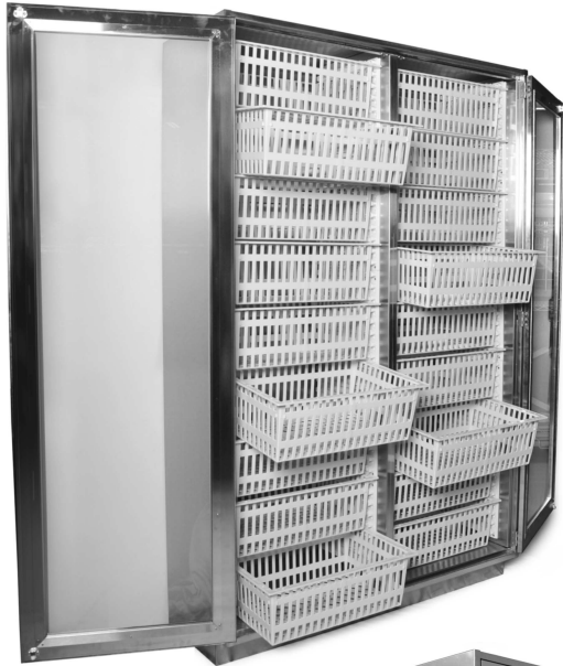
double-width unit *

Heavy gauge type 304 stainless steel construction. 45 slides on inner panels enable a variety of storage capabilities. Comes with solid or framed glass doors with double-panel inset construction, 4" wire pull, and roller catch. Offered in single- and double-width.