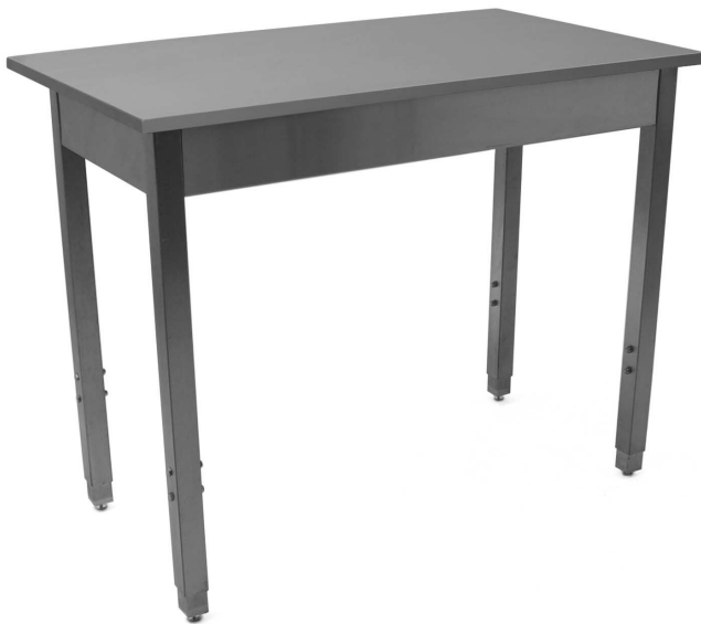
#SSC-AHTTP-2448 unit with tabletop

All stainless steel type 304 tables. Adjustable height from 30" to 37" (add 1" for tabletop). 2" square legs with leveling mounts. Heavy gauge corner angles are welded to the legs and tapped for bolting on 5" high aprons. 22"- or 28"-deep frame assemblies (add 2" for tabletop). Units with stainless top provided with a 16 gauge 304 stainless flat top with support channels. Designed and tested to the SEFA 8 Metal Casework recommended practices.