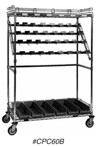
bulk storage cart

Flexible design allows the combination of hanger bars and wire shelves. 24" x 60" x 68" utilize 24" or 36" side wire shelves with hanger bars. Six 4" ledges on top and bottom shelf, two tote slides and boxes optional, 5" polyurethane swivel casters, two with brake. Dolly base available with 5" poly casters, two with brakes.