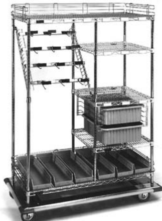
#CPC6024B combination-style cart