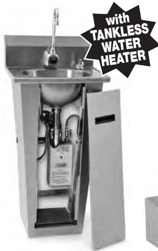
hand sink with hot water heater