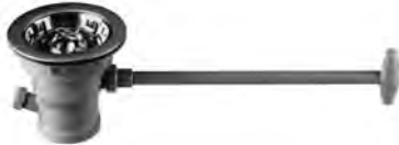
polymer rotary drain