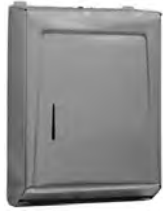
model #318496 towel dispenser