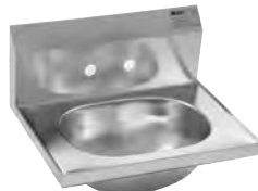
hand sink with electropolished finish

EAGLE GROUP 100 Industrial Boulevard, Clayton, DE 19938-8903 USA Phone: 302-653-3000 • Fax: 302-653-2065 www.eaglegrp.com