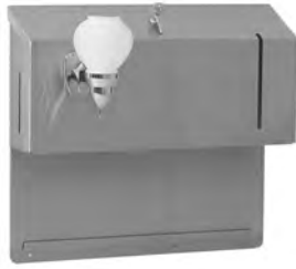
model #DP-10 towel dispenser