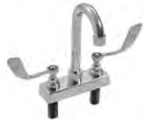
standard wrist handle faucet