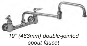
19" (483mm) double-jointed spout faucet