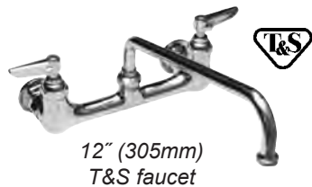
12" (305mm) T&S faucet