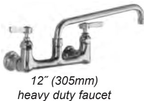
12" (305mm) heavy duty faucet