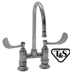
T&S wrist handle faucet