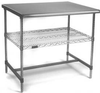
AdjuSTable® with H-frame base and wire shelf...

Eagle AdjuSTable® Work Surface System, model _____. Heavy gauge (brushed, electropolished) stainless steel top with choice of base combination: one wire undershelf and one C-frame or H-frame, or two C-frames or H-frames. Four 33" front posts. Wire undershelves feature patented QuadTruss® design.