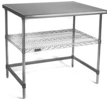
...with C-frame base and wire shelf