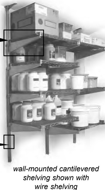
wall-mounted cantilevered shelving shown with wire shelving