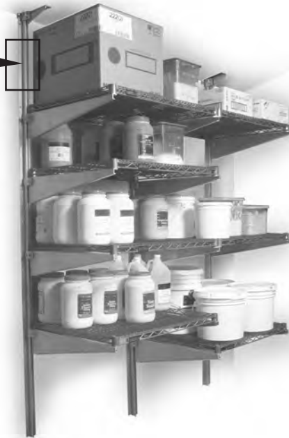
wall-mounted cantilevered shelving shown with wire shelving