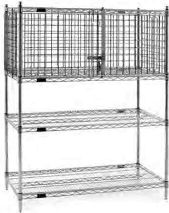
security module with hinged doors

Eagle Security Modules, model _____ (EAGLEbrite® zinc, Chrome, EAGLEgard® Epoxy, Stainless Steel) finish. Includes door(s), end panels, and rear panel. Available with hinged doors or single flip-up door. Fits in between two wire shelves that are spaced 20" apart.