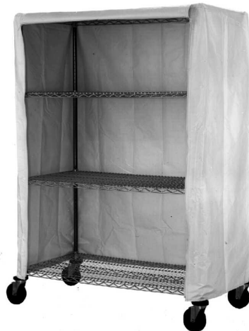
panel folds back for easy shelf accessibility