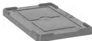
tote box cover (for TB1016 and TB1722 series)