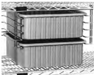
slide system with tote boxes