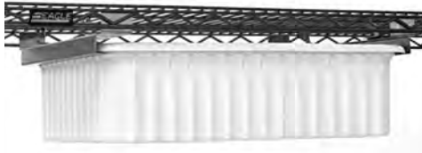
adjustable undershelf slides with tote box