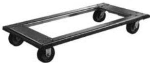
aluminum truck dolly

Includes designated casters and wraparound bumpers. Poly tread.