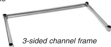
3-sided channel frame