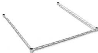
3-sided double truss frame