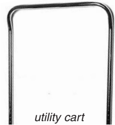
utility cart handle