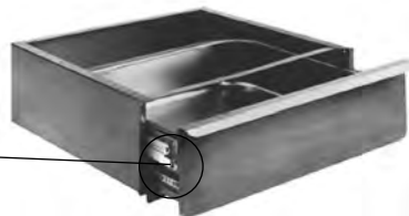
drawer assembly with NSF-approved slides