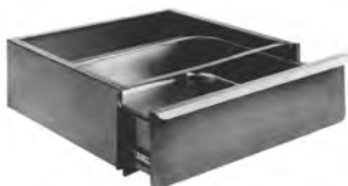
enclosed drawer assembly

* Holes are predrilled for 20" x 20" drawers only.