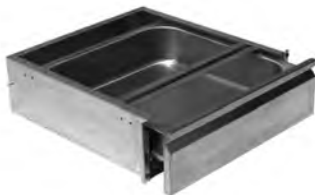
SPEC-MASTER® heavy duty drawer assembly