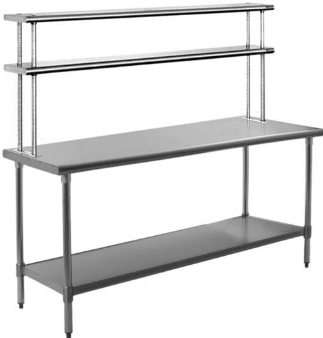
worktable shown with Flex-Master® overshelf system

Eagle Flex-Master® Overshelf System to consist of 10"- or 12"- wide shelves—16/430 or 16/304 stainless steel, adjustable in 1" increments without the use of tools. Shelves feature split sleeves with a tapered collar for mounting onto posts. Stainless steel posts include mounting plates. Optional stainless steel pot hooks and utility racks available.