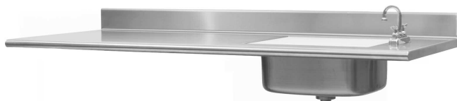
stainless steel countertop with rolled front edge, 4½" backsplash and integrated sink bowl

Standard tops include 14 or 16 gauge worksurface in type 304 or 316 stainless steel. Supported by either a plywood backer, or stainless steel hat channels. Drawn or fabricated integral sink bowls provided per specification. Standard backsplash 4½"-tall by 1"-deep, with a 45° return. Cove corner standard on end splash(es) and backsplash. Up to 12' length without a seam. Welded or mechanical joint on longer lengths. Latex sound-deadening optional. Countertops are built to meet the specification.