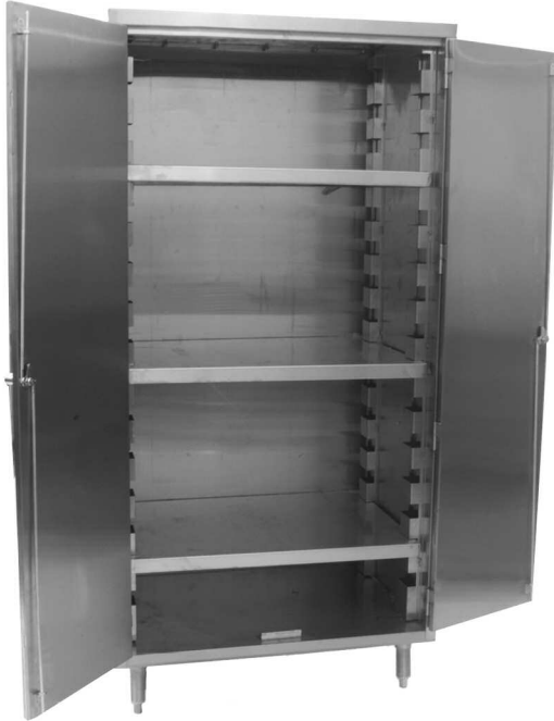
#VSC2436-3 vertical storage cabinet

All stainless steel type 430 enclosed cabinet. Three adjustable shelves on 4" centers, 24"-deep by 36"- or 48"-long. Available with slanted top for laminar flow.