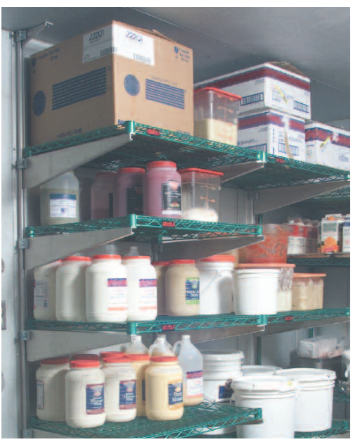
use in refrigerators/freezers

EAGLE'S CANTILEVERED SHELVING SYSTEM IS A SYSTEM THAT SEEMS TO DEFY GRAVITY... NO POSTS ON THE FLOOR; NO NEED TO REINFORCE SIDE WALLS. INSTEAD, A COMBINATION OF UPRIGHTS AND BRACKETS SUPPORT UP TO 530 LBS. PER SHELF.