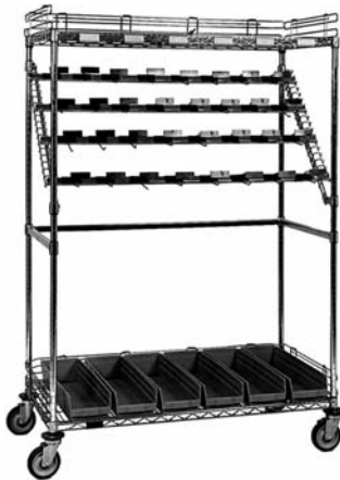
#CPC60B bulk storage cart

Flexible design allows the combination of hanger bars and wire shelves. 24" x 60" x 68" utilize 24" or 36" side wire shelves with hanger bars. Six 4" ledges on top and bottom shelf, two tote slides and boxes optional, 5" polyurethane swivel casters, two with brake. Dolly base available with 5" poly casters, two with brakes.