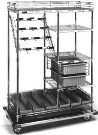
#CPC6024B combination-style cart