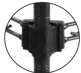
New Quad-Adjust® Collar - allows the addition or removable of a shelf without having to disassemble the entire shelf unit.

Foodservice Division: (800) 441-8440 • MHC/Retail Display Division: (800) 637-5100 • Fax: (302) 653-2065 • www.eaglegrp.com