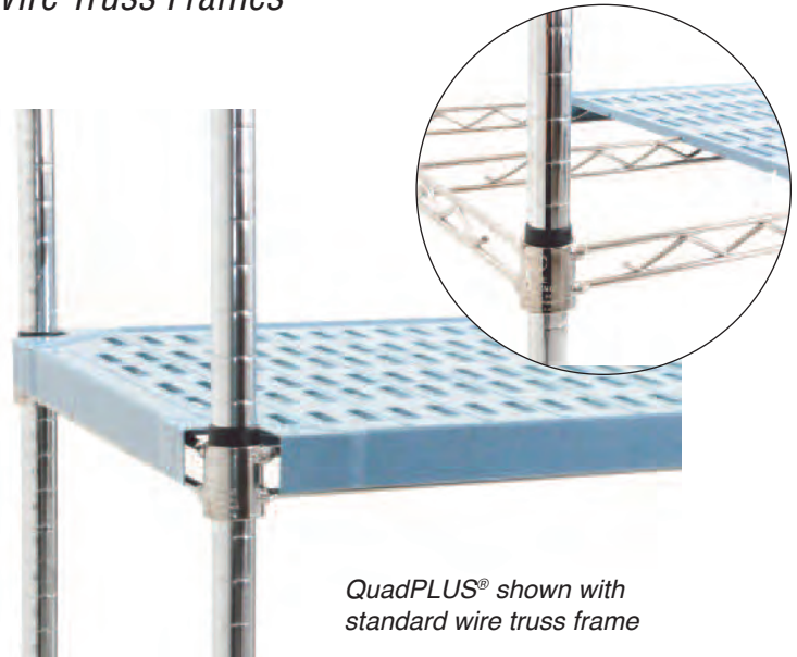
QuadPLUS® shown with standard wire truss frame