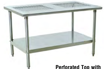
Perforated Top with Solid Undershelf