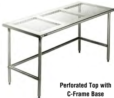
Perforated Top with C-Frame Base