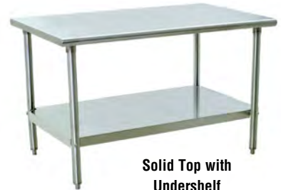
Solid Top with Undershelf