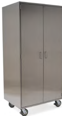
Vertical Storage Cabinet - Mobile