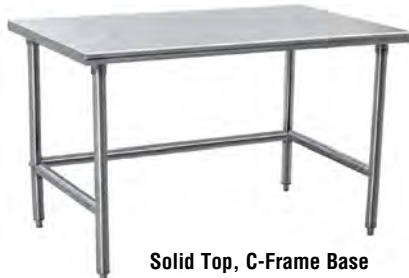
Solid Top, C-Frame Base