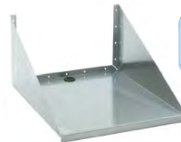
Equipment Shelf – with Cord Cutout