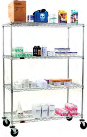
QuadTruss® Units – 4 or 5 Shelf Units