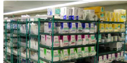
QuadPLUS® Polymer Shelving - Green Panels