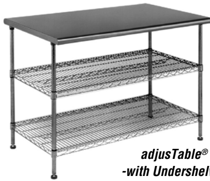
adjuTable® -with Undershelves