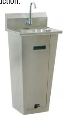
Traditional Hand Sink -with Foot Pedal