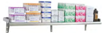
Snap-n-Slide® – Solid Shelves