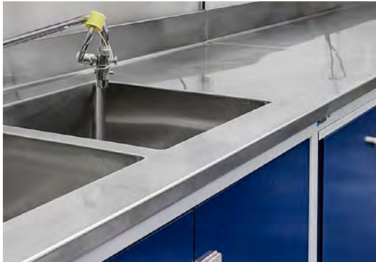
Stainless Steel Countertops