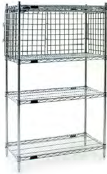
Module Unit* – Flip-Up Door