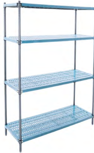
QuadPLUS® Polymer Units – 4 or 5 Shelf Units

Click on the EG number button to download the spec sheet for each product.