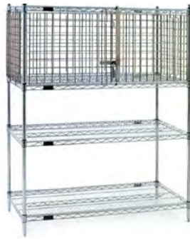
Module Unit* – Hinged Door