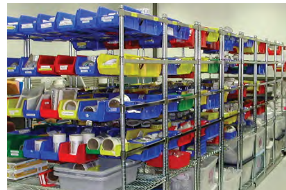
Double Deep Floor-Trak® shown with bin rails, sold separately.