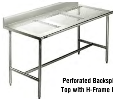
Perforated Backsplash Top with H-Frame Base