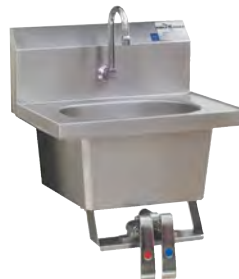
Traditional Hand Sink -with Knee Valve