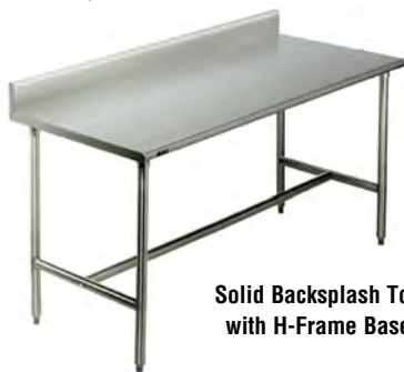
Solid Backsplash Top with H-Frame Base