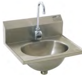
Traditional Hand Sink -with Battery Powered Faucet