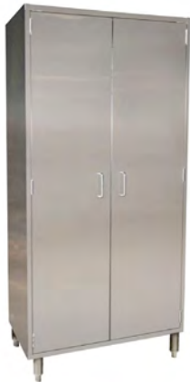
Vertical Storage Cabinet - Stationary