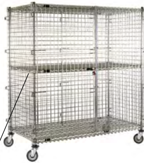
Mobile Security Unit – Chrome Finish