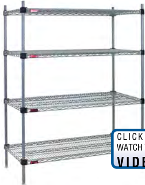
Quad-Adjust® Units – 4 or 5 Shelf Units