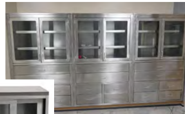
Wall Mounted Cabinet -Glass Doors

EAGLE SpecFAB Division Quality Stainless & Millwork Fabrication