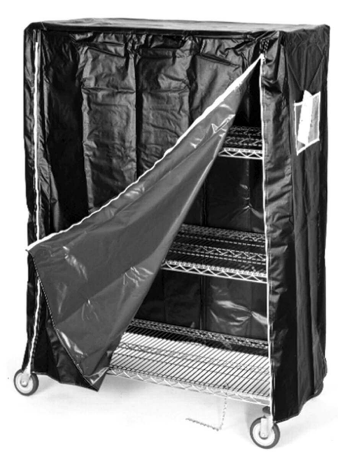
ESD cart cover in use