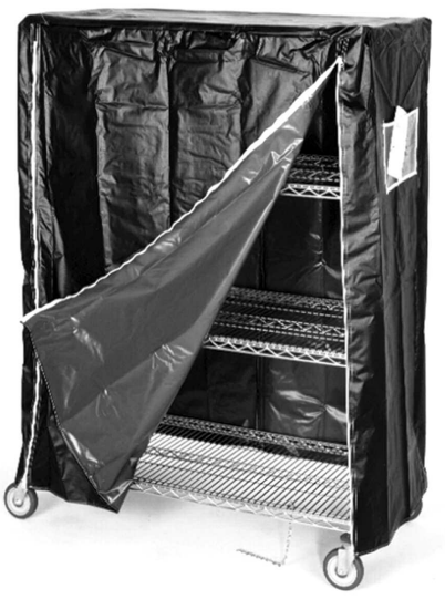
ESD cart cover in use