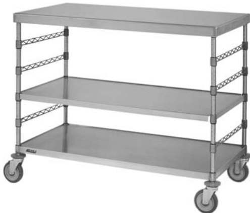
Steril-Eze® horizontal open surgical case cart

Cart dimension are 24" wide x 36" long x 36" or 48" tall. 16 gauge 300 series stainless steel top with two adjustable 18 gauge solid shelves. 5"-diameter polyurethane swivel casters, two with brake.